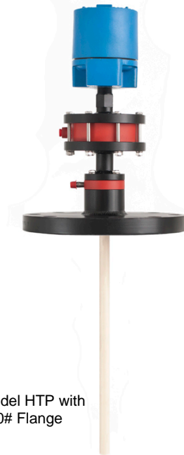
Basic Model HTP with 6"/150# Flange